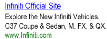
Figure 2. Sponsored Ad from Google – triggered by the search query: "BMW", an example of competitive piggybacking

d. Occurrence of the brand name in the ad title, text, or URL – In addition to advertiser complaints about piggybacking, unauthorized use of companies' trademarks displaying in the ad have also drawn complaints [e.g., 47]. Like piggybacking, enforcement of trademark policies by the search engine is not taken until the advertiser complains directly to the search engine.