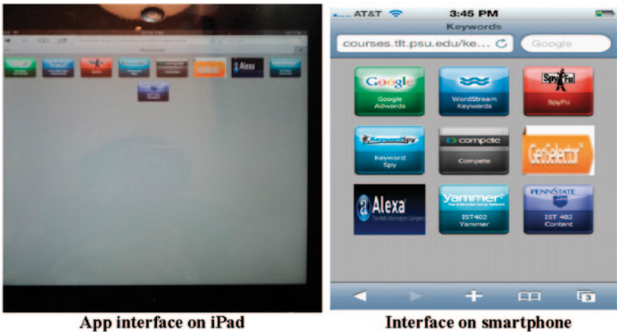
Fig. 2 The App interface displayed in iPad and smartphone

particular lesson. As a response to those issues, the instructor can select extra materials that are uploaded to the server and accessible by the students via the mobile app.